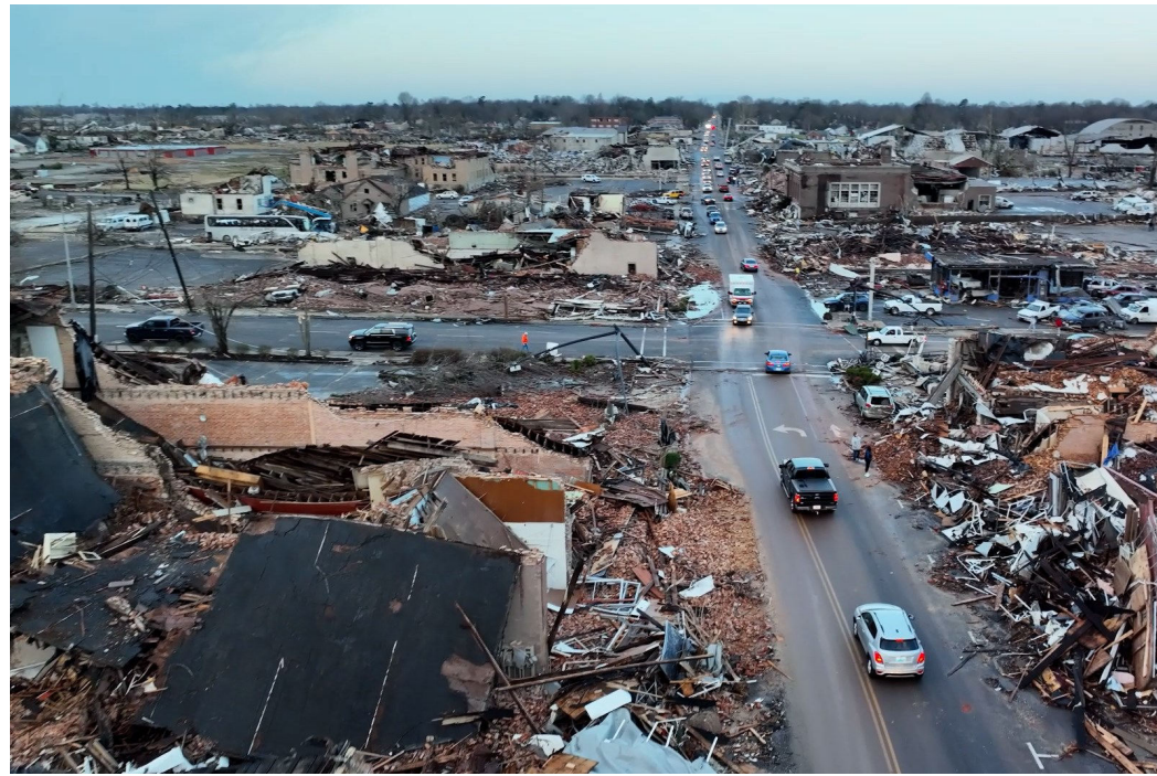
Mayfield, Kentucky tornado damage, December 15, 2020